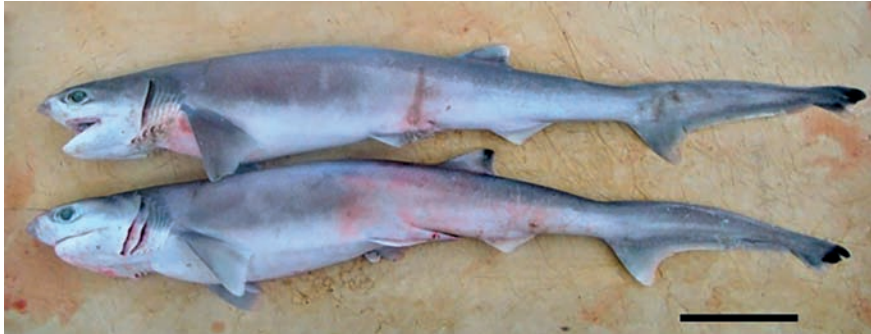
Fig. 2. Hepranchias perlo collected off Bizerte, with scale bar = 100 mm.