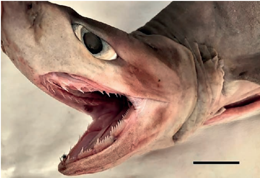
Fig. 3. Head of Hepranchias perlo , mouth opened to point out shape of teeth from upper and lower jaws, with scale bar = 30 mm.

Morphology, morphometric measurements and colour are in total agreement with descriptions of Hepranchias perlo given by CAPAPÉ (1980), BOESSEMAN (1984), EL KAMEL-MOUTALIBI et al. (2014) and RAFRAFI-NOUIRA et al. (2015b). The first record of H. perlo in the Gulf of Tunis was reported by RAFRAFI-NOUIRA et al. (2015b), and the recent captures of the species seem to confirm its presence in the area.