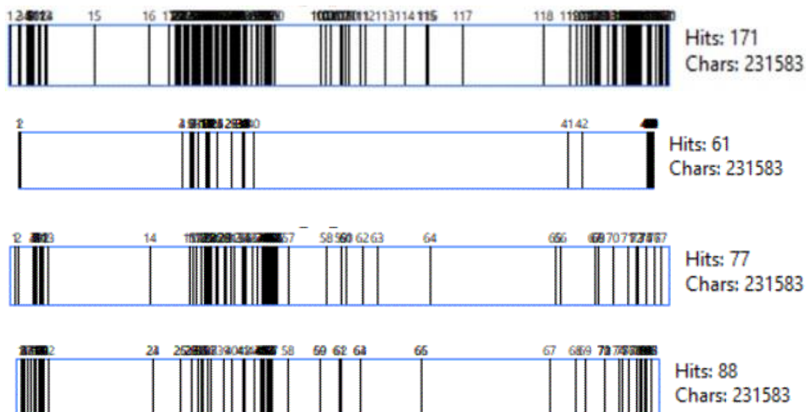
Figure 6 Concordance plots for God, you, his, he in Laudato Si' .

Extract (2) from Chapter 2 illustrates the recurrent use of some of these keywords as well as the religious orientation of the chapter: