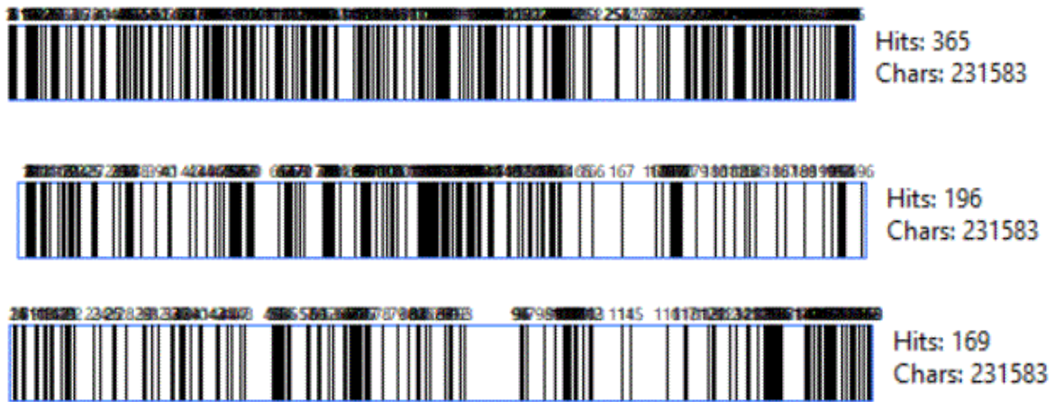
Figure 7 Concordance plots for we , human and world in Laudato Si' .

To conclude, the lists of keywords obtained from the comparisons of different groups of chapters in Laudato Si' and the concordance plots that visualise their dispersion suggest that the text as a whole calls all human beings to action. However, Chapters 1, 3, 4 and 5 delve specifically into various aspects of current environmental issues, while Chapters 2 and 6 explore the religious implications of the environmental crisis.