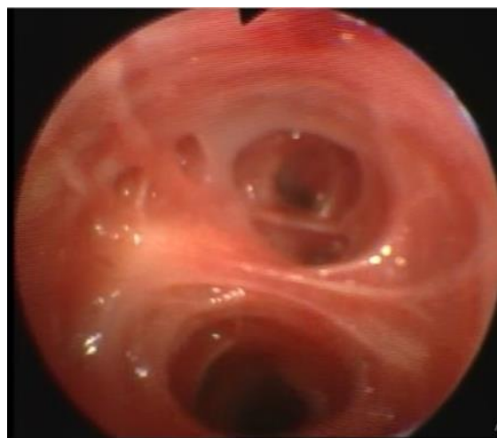
Figure 3. Peripheral bronchiectasis