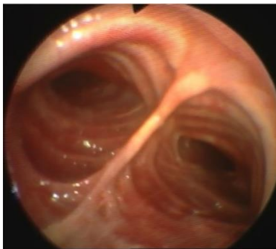
Figure 2. Bronchomegaly with diverticula located on the posterior wall of the left main bronchus immediately after the carina.