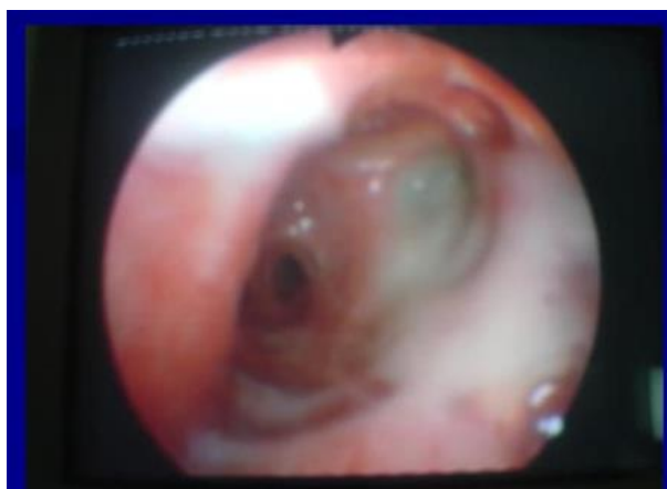
Figure 4. Mucopurulent secretions present in the subsegmentary bronchi